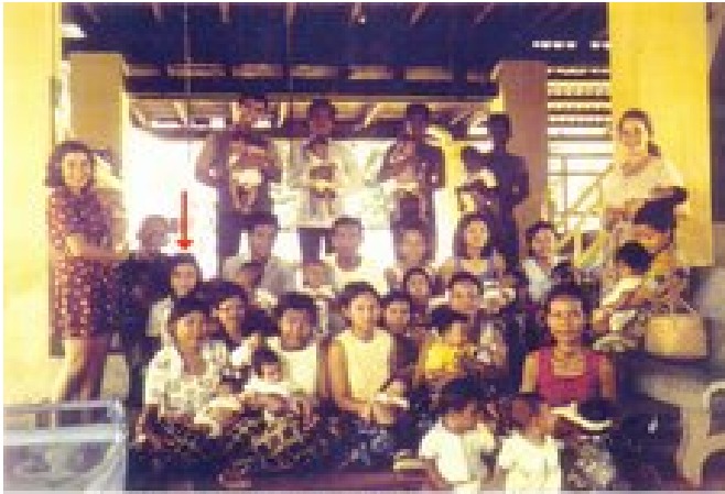
Red arrow points to man with glasses