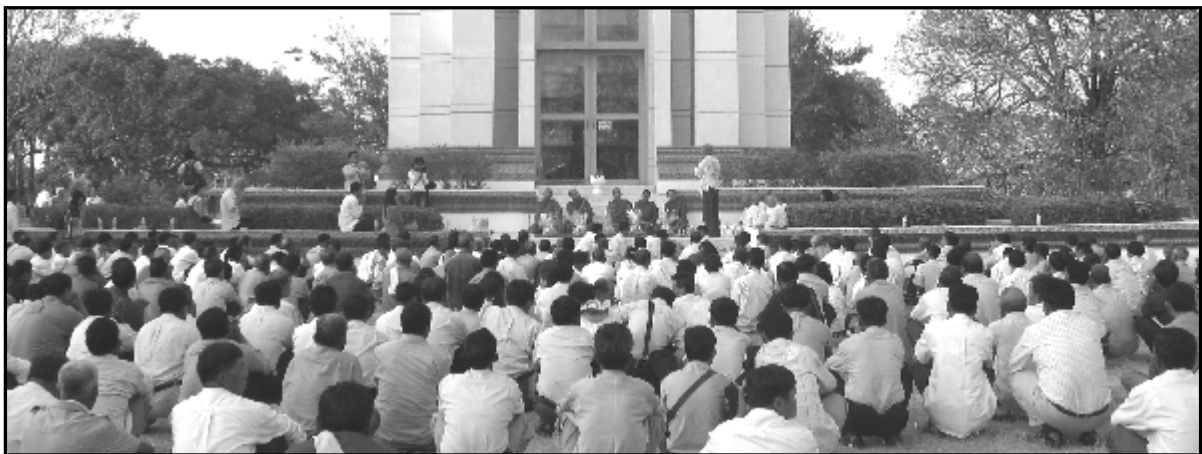
The Bang Skaul ceremony is performed at the Choeung Ek Killing Fields Memorial. Five monks and several nuns led the Buddhist chants.

for efficient trials with swift and fitting punishments for those found guilty (some of those attending did not realize that Cambodia does not have the death penalty). The third segment of the tour was a visit to the Choeung Ek Killing Fields Memorial, where a traditional Buddhist ceremony, Bang Skaul , was held at the grounds to bless the souls of the people who had died there.