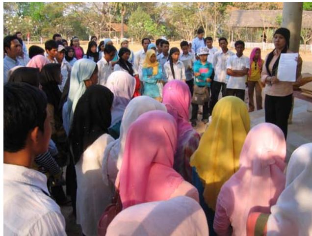
Explaining the essay contest to Cham students

To engage Cham Muslims in this project, young people were encouraged to write about their parents' experiences during Democratic Kampuchea and their views on the Cambodian genocide. Announcements were distributed along with notebooks and pens to 150 young people across Cambodia for this purpose. Thirty-three articles were received; they will be published in the Cham quarterly magazine.