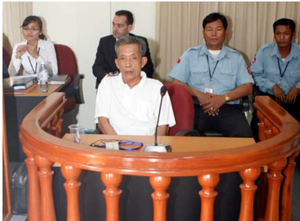
Duch, former head of Tuol Sleng prison, at his ECCC hearing

The ECCC's first public hearing was held on November 20. DC-Cam invited 40 victims of Democratic Kampuchea to witness the proceedings.