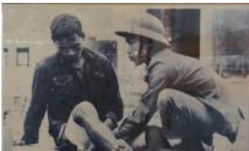
A Vietnamese soldier wounded in the war against the Khmer Rouge, on display at An Giang Museum