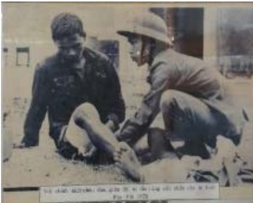
A Vietnamese soldier wounded in the war against the Khmer Rouge, on display at An Giang Museum