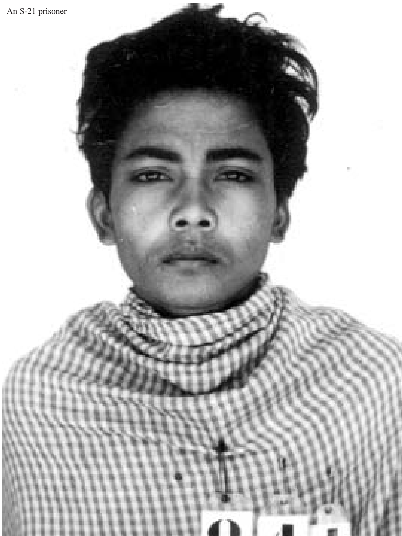
An S-21 prisoner