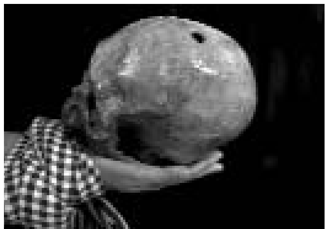
Cranium of a man, 30 to 55 years old. Gunshot wound of entrance in the superior-posterior frontal convexity (top of the head) with the bullet passing left to right and downwards into the brain and exiting the skull in the right temple. [Catalogue No. TSL17, 2A50699]