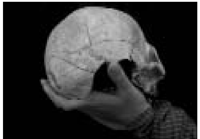
Cranium of a man, 25 to 45 years old. Complex system of radiating skull fractures due to an impact in the right posterior-lateral cranium near the mastoid process (right side of the back of the head). [Catalogue No. TSL6, 2A50696]