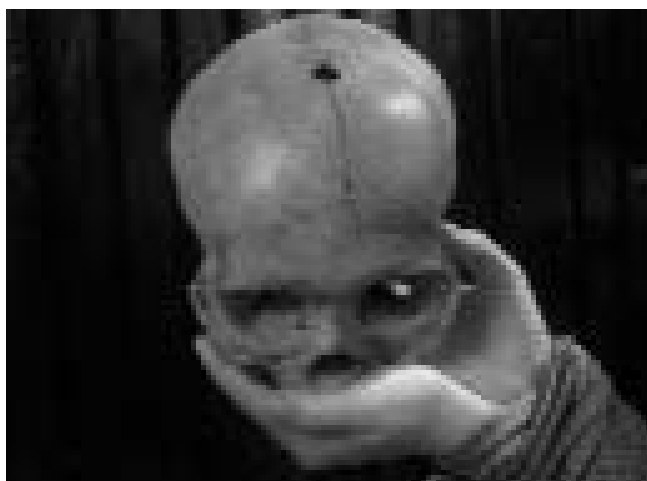
Cranium of a man, 25 to 45 years old. Gunshot wound of entrance in the left frontal convexity with the bullet passing into the brain from right to left and downward on a 45-degree angle (as indicated by the "keyhole" effect). [Catalogue No. TSL13, 2A50700]