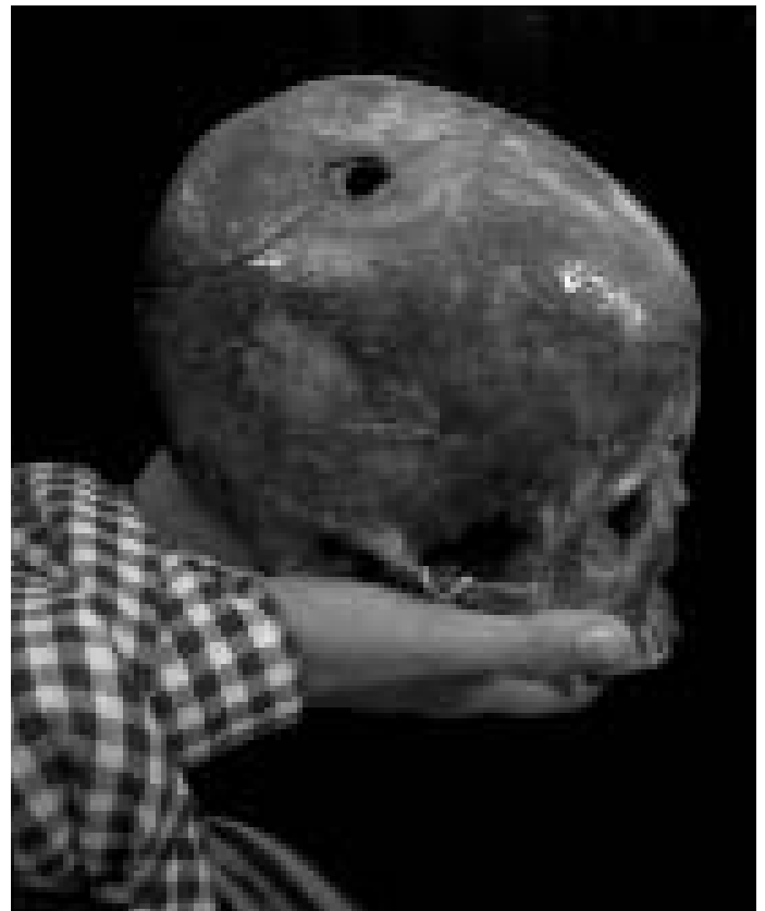
Cranium of a man, 20 to 40 years old. Gunshot wound of right anterior-parietal convexity (right side of the top of the head) with the bullet passing downward into the skull through the brain and exiting to the left of the foramen magnum (base of the neck where the spinal cord emerges from brain). [Catalogue No. TSL2, 2A50694]