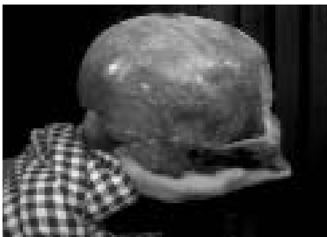
Cranium of a woman, 35 to 50 years old. Chopping/hacking wound on the anterior portion of the right parietal convexity (right side of the top of the head). [TSL11, 2A50709]

The skulls rest on identical pedestals built from slightly overlapping wooden slats. Spaces have been left between slats so that air can reach the skulls, thus allowing the spirits to come and go as they wish. To protect the skulls, we have placed them in clear, five-sided Plexiglas cases secured with soft silicone caulk. The cases can be removed by cutting the caulk with a razor blade, allowing the skulls to be cleaned or moved.