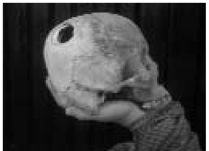
Cranium of a man, 30 to 50 years old. Blunt impact trauma of right mid-parietal convexity (right side of head) with a depressed "punched out" skull fracture. In addition, there are other skull fractures related to separate blunt impact sites on the back of the head on the left side and the left temple. [Catalogue No. TSL1, 2A50720]