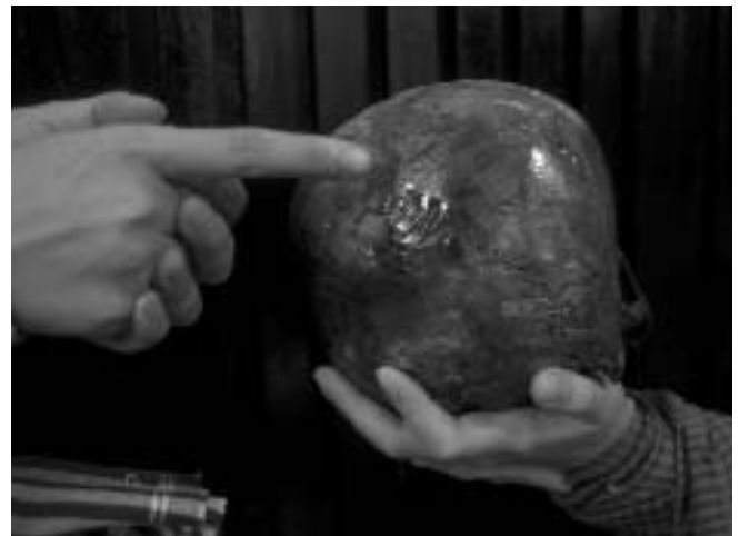
Cranium of a man, 20 to 40 years old. Two deeply incised wounds (cuts), or superficial chopping/hacking wounds superior to the right lambdoid suture (right side of the back of the head). [TSL3, 2A50707]

for Cambodia, but such a large budget will not guarantee this. Instead, it is likely that such a large sum will present temptations that encourage the norm of corruption in Cambodia. Both the UN and RGC should work to minimize expenses as much as possible, and to utilize local resources whenever practical. Only when these two bodies work together with the common and exclusive purpose of enforcing the rule of law in Cambodia can the possibility of fair trials be realized.