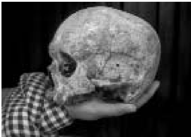
Cranium of a man, 25 to 45 years old. Deeply incised wound (cut), or superficial chopping/hacking wound crossing the left lambdoid suture (left side of the back of the head). [Catalogue No. TSL16, 2A50706]