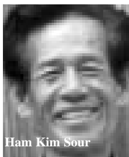
Ham Kim Sour

stressing that the entire populations of the 13 villages in Svay Teap Subdistrict were also killed in one day.