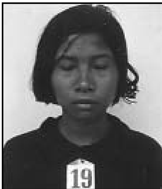
VOICES FROM S-21 Chapter Three: Choosing the Enemies David Chandler

to coincide with the Party’s “seventeenth” anniversary. By then Pol Pot was already in Beijing. In the speech, he referred to an “infamous handful of reactionary elements” working to undermine DK, but he named no names and struck an optimistic note appropriate to the occasion. In the meantime, Eastern Zone forces had inaugurated a series of unpublicized attacks on Vietnam. In late October, soon after Pol Pot returned from China, Vietnamese forces mounted a serious offensive against Cambodia. They remained on Cambodian soil,