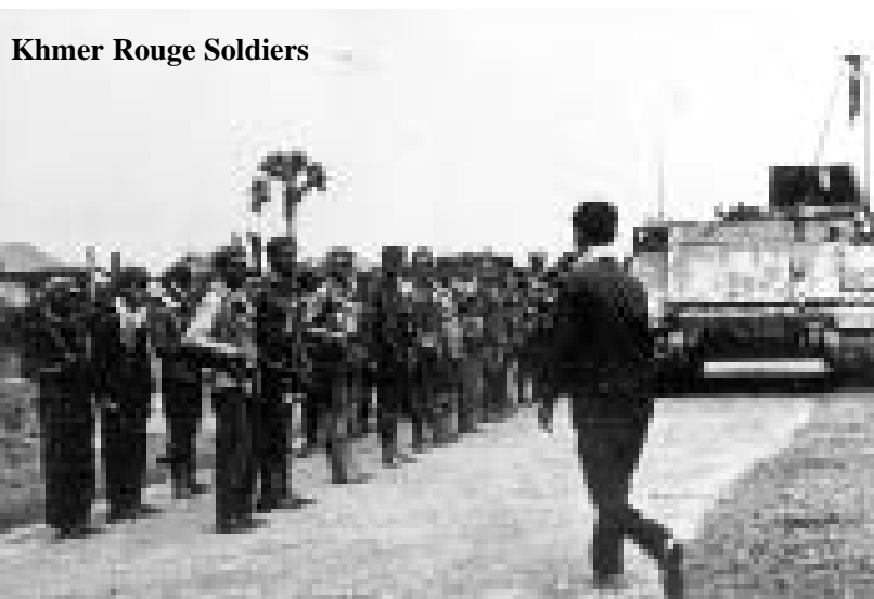
Khmer Rouge Soldiers

Generally speaking, on the eve of the invasion, the Vietnamese rather explicitly and frankly told their Soviet allies what they knew about the situation in Khmer headship. In October 1978, according to a high-ranking